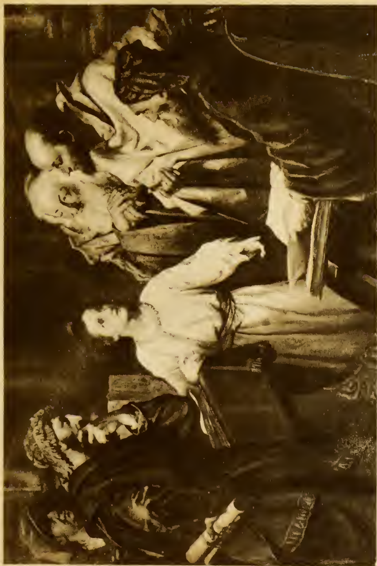
“After three days they found Him in the Temple sitting in the midst of the doctors, hearing and asking them questions.”